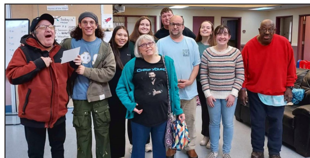
Our JMU APO friends