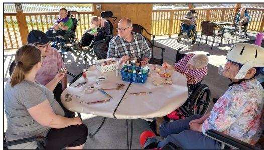
A 70 degree day in January under the pavilion.