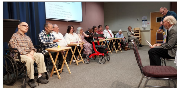
Pleasant View's Bell Choir performing at the Fall Banquet