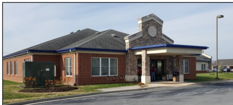
Pleasant View's Harrisonburg office

We are in the process of determining a more appropriate name for the Harrisonburg building for easier reference. The main phone number for Pleasant View is now (540) 433-8960. We are sorry for any inconvenience this move may have caused any of you. ●