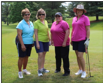
Care Free Home Health Team