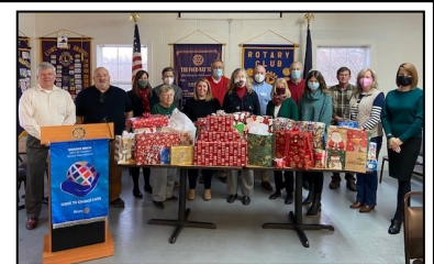
Rotary Club of Broadway-Timberville with presents for Pleasant View