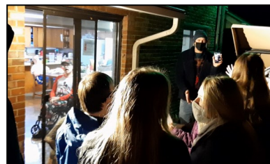
Carolers at Lee High

were donated by a member of Lindale Mennonite Church and shared with each person who wanted one. The weather was cold that night, but the mood was joyful, warm, and cozy.