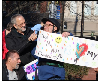
Rally participants in 2019