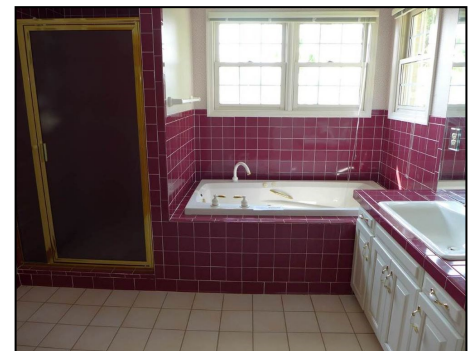
Brenneman House Bath (BEFORE)

As stated in our summer newsletter, Brenneman House is a single story 4-bedroom, three bath (two are en-suite baths) home in Battlefield Estates. To increase the home's accessibility, we began renovations to one of the two en-suite bathrooms in September. The bathroom, pictured right, had space, beautiful tile, a deep garden tub, and small stand-up shower. However it did not meet the physical needs of the individuals we support.