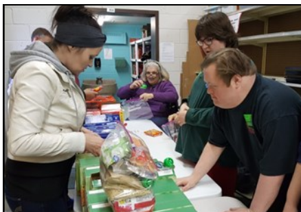
Broadway Day Program helps feed kids

This year our supporters provided the means for: