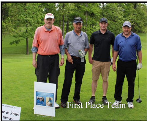
First Place Team

Pleasant View, Inc. hosted its 19 th Annual Charity Golf Event at Spotswood Country Club on Friday May 13, 2016. The sixty-eight golfers that participated had an great day to be out on a challenging course. This was our second year at Spotswood Country Club which provided impeccable service and amenities. While we did have a few sprinkles during the registration, the sun came out and the mountains sparkled as our teams headed out to play around 9 am. The weather couldn't have been any nicer. We ended the day with a hearty lunch catered by Hank's Smokehouse and gave out