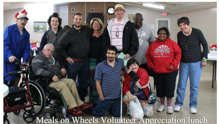
Meals on Wheels Volunteer Appreciation lunch.

We are receiving more referrals for Community Connections and are expanding to include some new volunteer sites. You can follow us on Facebook to get updates on what we are doing. We are at www.facebook.com/pleasantviewinc .