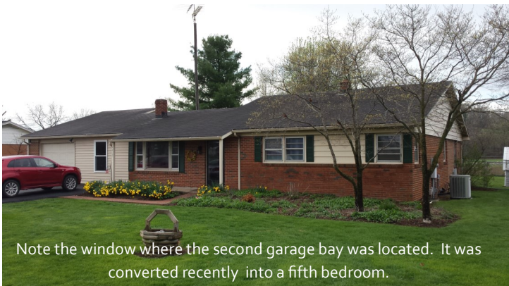
Note the window where the second garage bay was located. It was converted recently into a fifth bedroom.

We also chose to add a fifth bedroom to an often underused second garage bay. This additional bedroom provided the opportunity for