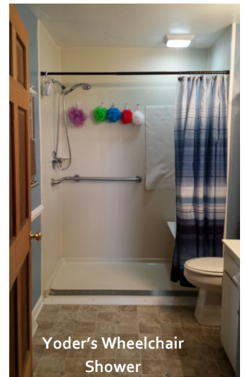
Yoder's Wheelchair Shower

Do you want good food, good service, and lots of smiles? Pleasant View is supporting two individuals at the Dayton Farmer's Market through Supported Employment. They would love to see you at Hank's for lunch or at the Country Meat Market. Pleasant View is able to support individuals one-on-one long term or decrease gradually as individuals become more proficient. •