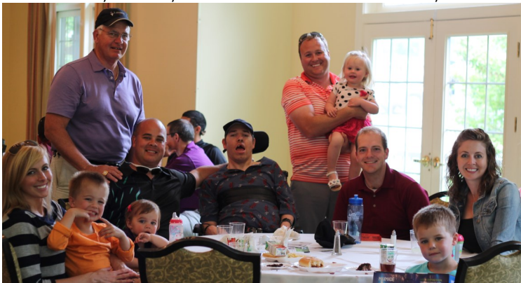
The Taylor Family makes the Golf Tournament a Family Event.