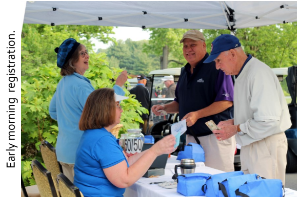
Early morning registration.