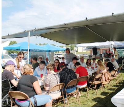
Pleasant View's 2014 BBQ

Check the Pleasant View Inc Facebook page and website for updates to the event. ★