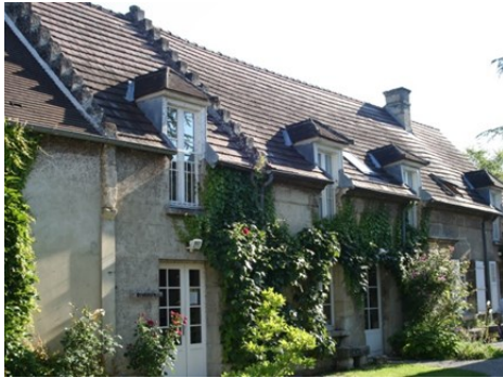
Situated in Trosly, France the Retreat Center offered beautiful accommodations.

On June 21 st I had the rare opportunity to travel to Trosly, France for a week long retreat with Jean Vanier, founder of L'Arche and co-founder of Faith and Light. This retreat was set up for encouragement and formation of leaders from North American Faith and Light communities. Jean Vanier spoke twice each day on the theme "Learning from Those Who are Weak." His text was the Gospel of John. The rest of the time was spent either in silence or worship with one hour each day reserved for small group sharing.