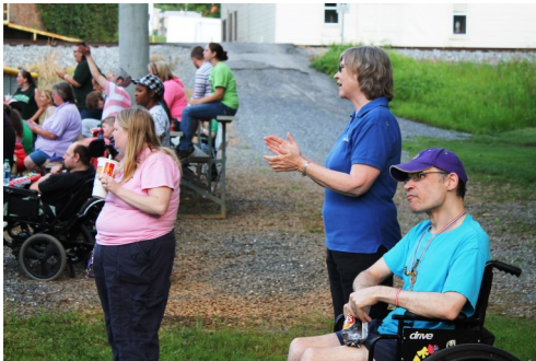
Harrisonburg and Broadway fans.

needed to make dinner. In the end, Harrisonburg won by one run. Stay tuned to Facebook for the rematch. ⚾