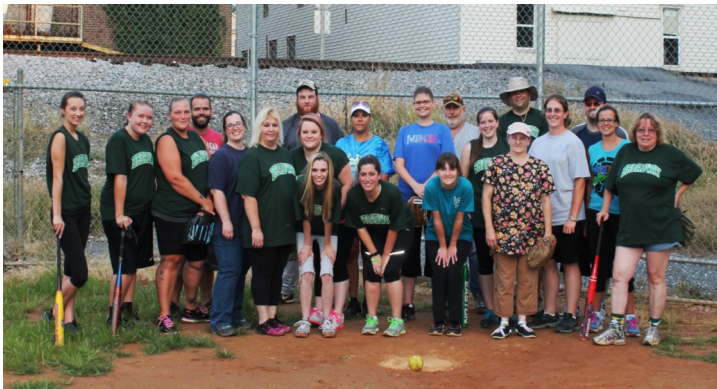
Pleasant View, Inc.'s Harrisonburg and Broadway softball players.